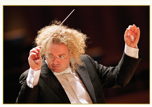
Stéphane Denève, Brussels Philharmonic Orchestra